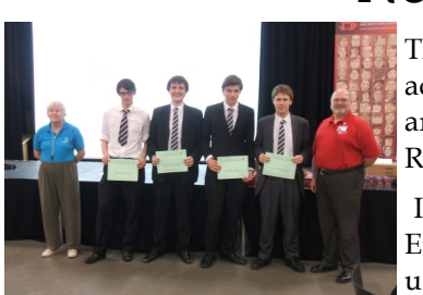
Second place winners of the Reading Area Senior Maths Challenge