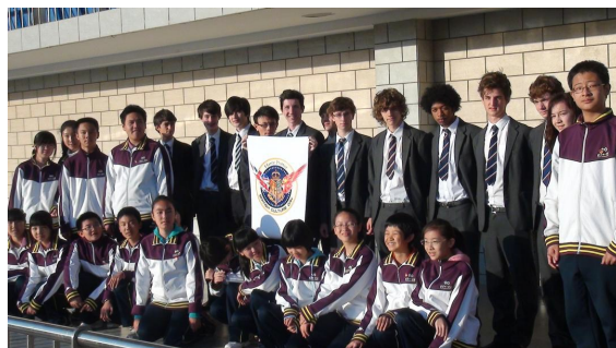
On the platform for the flag raising ceremony