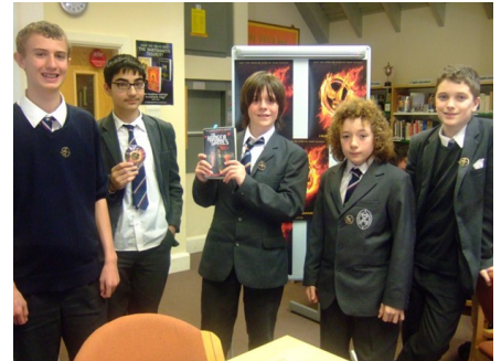
Some of the members of the book club with The Hunger Games book proudly wearing their prized badges.

I contacted the film distribution company, Lionsgate Films who very kindly sent us some posters and badges. Each member of the book club was given one of each and they have proved very popular. The boys really enjoyed this experience and being able to tie it in with another form of media has made it appeal to a wider community in the school.