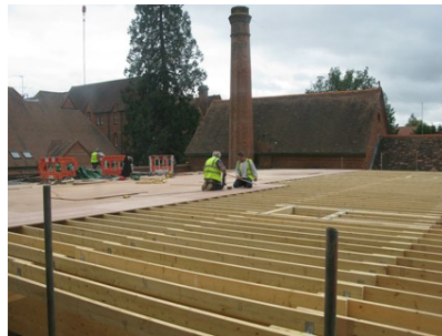
October 11 – Beginning to board out the roof