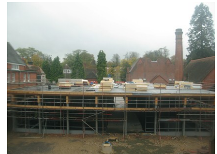
October 13 – Boarding out completed