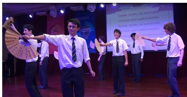
Our fan dance for the British Culture Day celebration