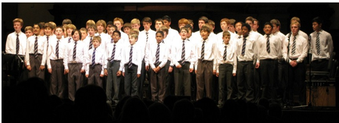
East House Choir sing "I'll be there for you"

Inter-house Music 2011, on Tuesday November 15 th , was a showcase for the many virtuoso musical talents at Reading School. The Town Hall was packed with proud parents, as each of the four houses presented a 25 minute musical programme.