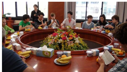
Meeting with local students

After an enriching week, we arrived in Shanghai High School. All of us were impressed by this world-class school. The school has a beautiful campus. It is well-known for its great academic achievement. We did more Chinese craft and attended a few more academic subject lessons. The level of Maths for their students were unbelievable. We were also impressed by their science labs, with a chemistry lab alone cost a million pounds!