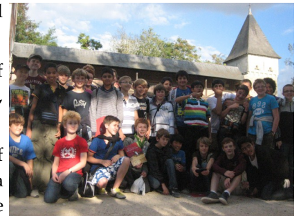
Outside Clos Luce, Leonardo da Vinci's house

Once we had finally arrived and been driven home by our families in groups of twos or threes, we had dinner before having some sleep. Once up in the morning, we all met at our coach for the day's activities.