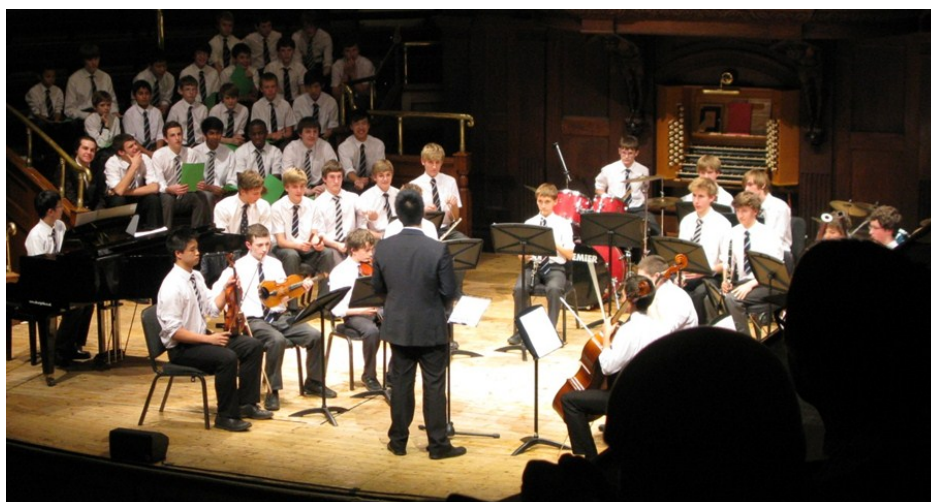
School House Orchestra get ready to play The Pink Panther Theme