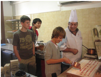
Making candy canes sweets in the chocolate factory.

A visit to a castle, an excursion to the house of Leonardo da Vinci, a day- trip in Tours and a chocolate- maker's shop were some of the activities enjoyed, not to mention the aquarium where we met some very friendly fish and a very a fascinating underwater lizard. But the highlight of the week was the theme park Futuroscope, which had many 3D movie simulators as well as rides.