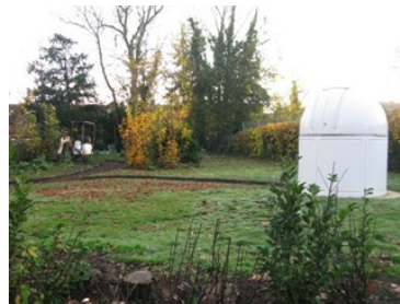
The current untidy mess