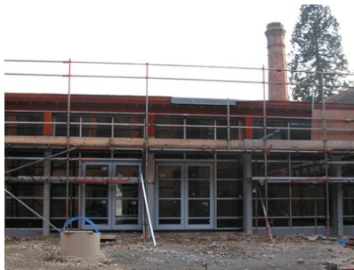
November 11 – Glazing and doors in place