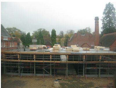
November 11 – Insulating the roof