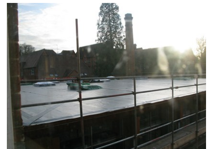
November 18 – Roof almost watertight