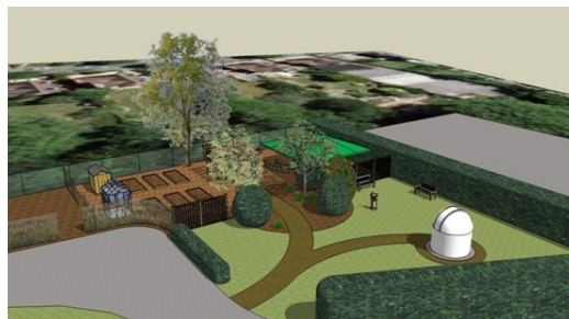
The vision for the future