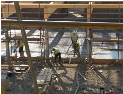
September 23 – Pouring the concrete flooring

There is a buzz of excitement amongst the school community as they watch the project evolving. Discussions with furniture suppliers are now underway, and we have obtained a selection of samples. We are now consulting with staff and students about their preferences and requirements, before finalising the interior décor. We are all very much looking forward to utilising this much awaited space.