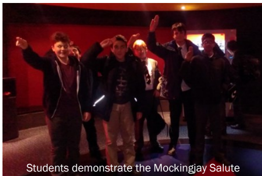
Students demonstrate the Mockingjay Salute

Fortunately, this news was met with unanimous approval and on one fateful afternoon in December the tributes marched into Reading town centre to meet their destiny.