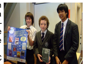
The winning book