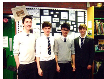
The Titanic display and members of the Book Club with the display

We have now moved onto a display celebrating the Diamond Jubilee. We hope the school community will come and take a look, and some tutor groups will be having a 'fun quiz' that goes with the display. Part of the display commemorates the visit of the Queen in May 1986, she was here to unveil a window in the chapel on the occasion of the school's quincentenary.