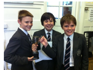
The winning East House team

On 11 th July we ran a Year 7 Training Day in public speaking, culminating on 13 th July in the Year 7 Public Speaking competition. East House won, taking three of the four awarded prizes (Best Chairman, Best Questioner and winning team). West won Best Speaker. (Last year West swept the board in the same way!)