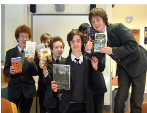
Members of the Book Club with the Carnegie shortlisted books