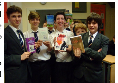
Book Club Members with the nominated books

The boys have greatly enjoyed this reading challenge; it has opened their eyes to books and genres that they might not have necessarily chosen for themselves and they are now looking forward to the Carnegie Book Award which we will start to shadow after the holidays.