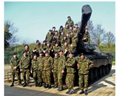
READING SCHOOL CCF FIELD DAY - ARBORFIELD GARRISON - 15 MAR 2012