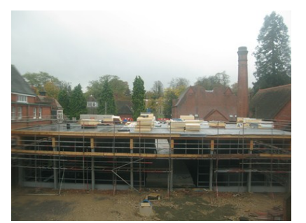
November 11 – Insulting the roof