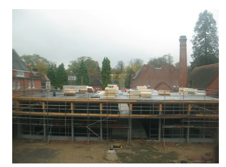
October 13 - Boarding out completed