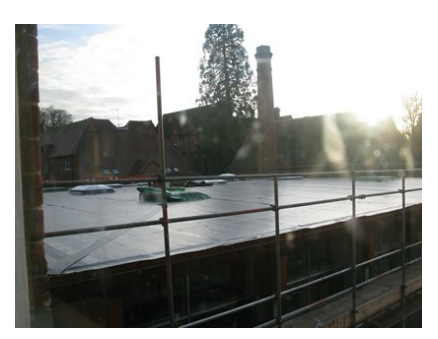
November 18 – Roof almost watertight