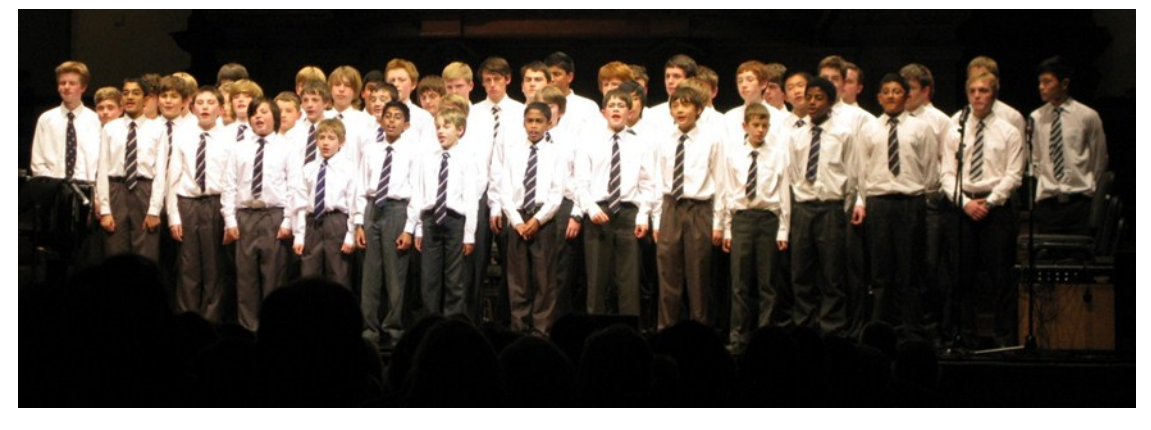
East House Choir sing "I'll be there for you"

Inter-house Music 2011, on Tuesday November 15<sup>th</sup>, was a showcase for the many virtuoso musical talents at Reading School. The Town Hall was packed with proud parents, as each of the four houses presented a 25 minute musical programme.