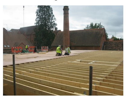
October 11 - Beginning to board out the roof