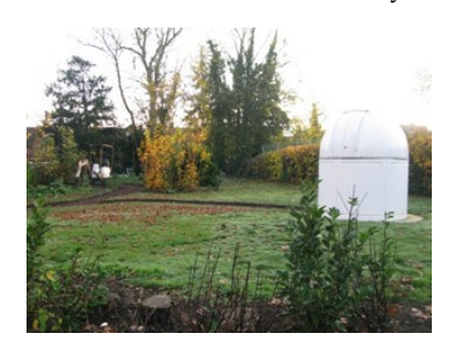
The current untidy mess