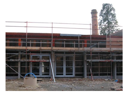
November 11 – Glazing and doors in place