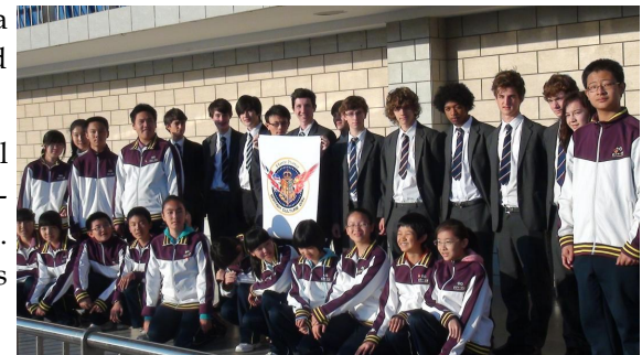
On the platform for the flag raising ceremony