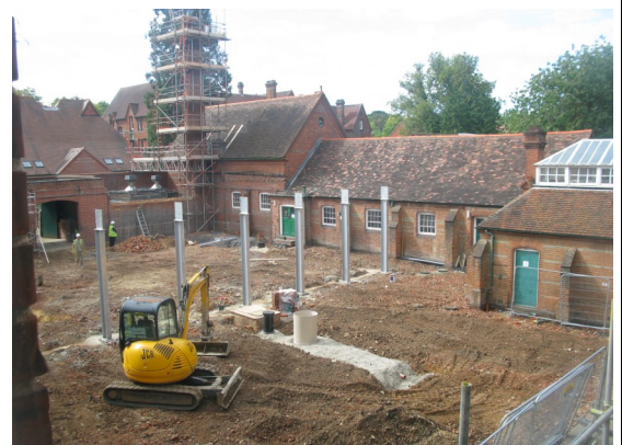
August 26 – Roof supports are in place