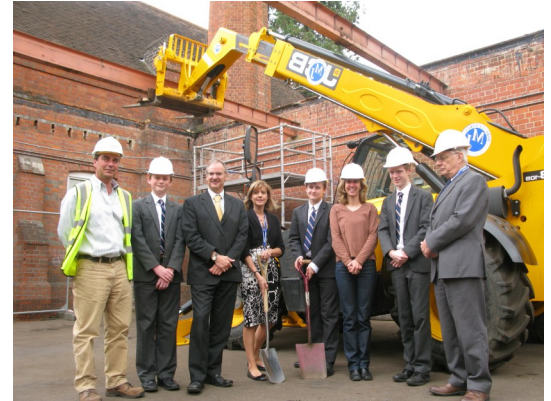
July 20 – Digging out ceremony

I am sure it is clear from these photographs that the Quad has been at the centre of some very intensive work over the summer. The foundations have now been laid and both upright girders and glulam crossbeams are in place. We are still on course for an opening in the second half of next term, but much depends on the weather over the winter. There has been minor disruption, but we are doing our level best to keep this to a minimum. Staff and students are to be commended for keeping going in such a business-like way. Sixth Form students are involved in the design and layout of some of the interior spaces and the Student Council will be given regular updates on progress.