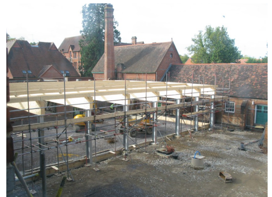
September 16 – Roof beams are in place