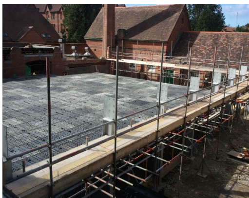
September 13 – Scaffolding is up

I am sure it is clear from these photographs that the Quad has been at the centre of some very intensive work over the summer. The foundations have now been laid and both upright girders and glulam crossbeams are in place. We are still on course for an opening in the second half of next term, but much depends on the weather over the winter. There has been minor disruption, but we are doing our level best to keep this to a minimum. Staff and students are to be commended for keeping going in such a business-like way. Sixth Form students are involved in the design and layout of some of the interior spaces and the Student Council will be given regular updates on progress.