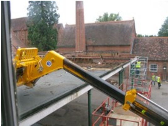
July 18 - Demolishing the old canopy in the quad