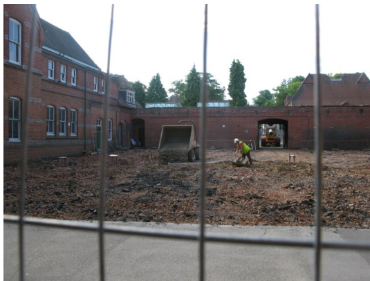
August 2 – Pouring the foundations