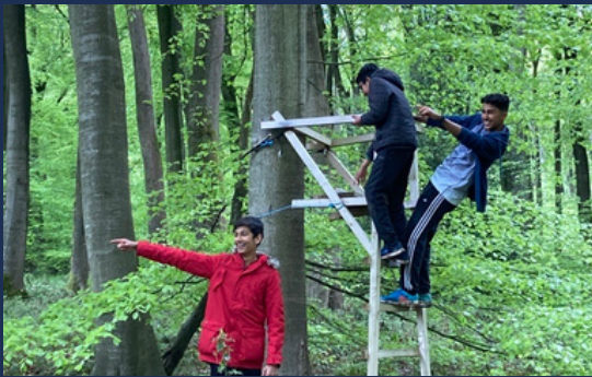
Power to the 9's