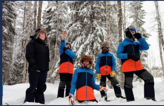
Boys that Bond