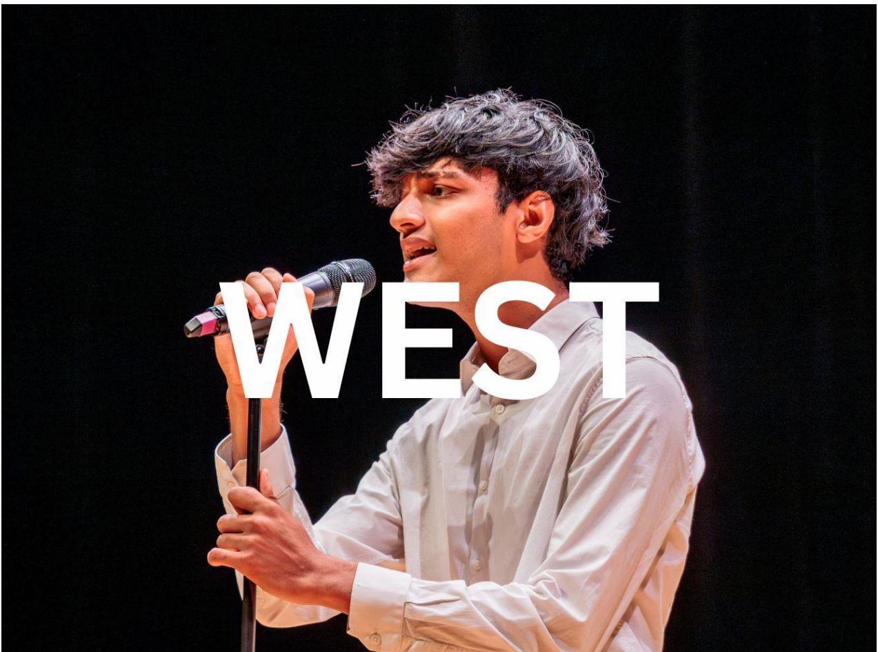
County House / West House